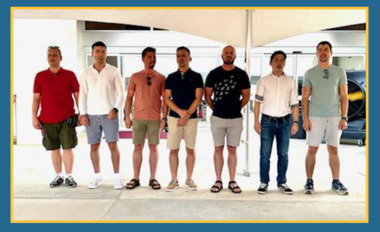
Polish airmen entertain crowd with a song